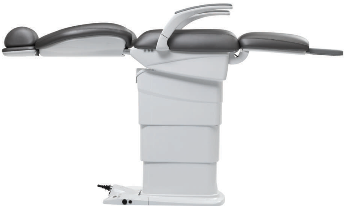
Motorized backrest height adjustment